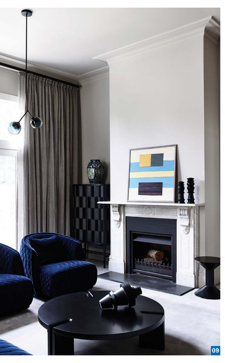
09 Velour-upholstered armchairs and an ornate fireplace bring a sense of warmth and comfort to the adult's lounge. Artwork: Patti Bergin.